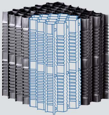
BIOdek® KVP 623

Optimum Water Circulation and Sludge Removal in Biological Processes