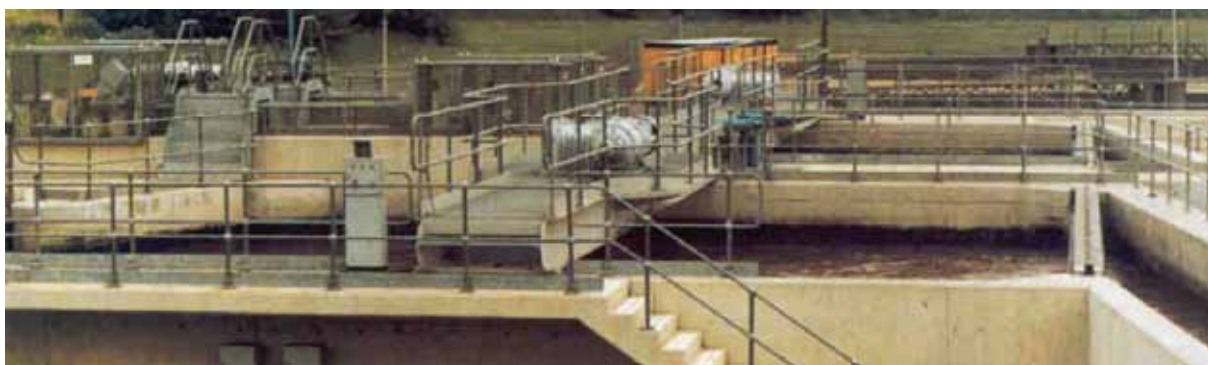
An installation of two 12.0m diameter J+A Crossflow™ grit removal units.

A specialized grit pump is available from Ovivo. It has a range of duties, all designed to satisfy the majority of grit pumping requirements associated with grit and grit/solids in raw sewage. The pump is a recessed, vortex flow type impeller with a full 100mm diameter solids free-way. Automatic priming is available on this pump, enabling it to be installed above the water level and at bridge or platform level, where servicing and maintenance is easily carried out.