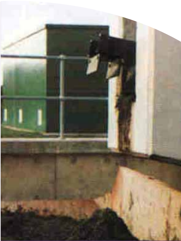
A reciprocating Rake Classifier operating in conjunction with a J+A Crossflow™ grit trap.