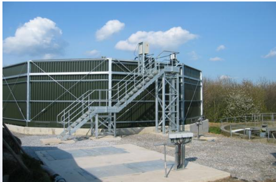
Typical detail of ventilation panel fitted around the filter base

A large NTF filter with alternate faces fitted with lift-up type hatches to control air flow during the winter months.