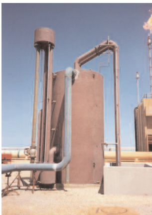
Oil & gas industry 2 Bed Filter

The AGF Autonomous Valveless Gravity Sand Filter treats the entire cooling water system and can remove up to 98% of suspended solids ingested by the cooling tower and thus solve the major problem encountered in open circuit cooling systems. This fine material accumulates in the system and can only be partially removed by blow-down. Efficient side-stream filtration is the only way to keep the water clean. The filtration rate is set to ensure that solids removal equals solids ingress with resultant water quality normally at around 5mg/l suspended solids.