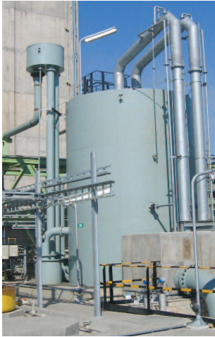
Chemical industry 2 Bed Filter