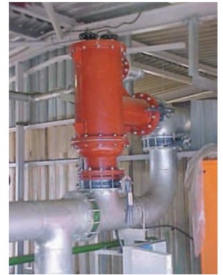
Re-circulated ground water cooling system automobile industry