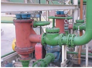
Re-circulated ground water cooling system 2 duty plastics industry

If your cooling water problem is particulate matter that can block nozzles, seals, lantern rings etc. then these can be effectively removed by the Kleerflo range of Automatic backwashing screen filters/strainers .