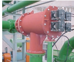
Re-circulated ground water cooling system mining industry