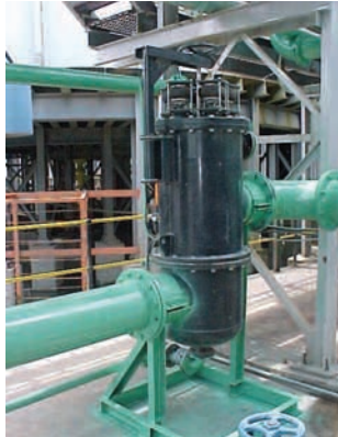
Re-circulated ground water cooling system mineral industry