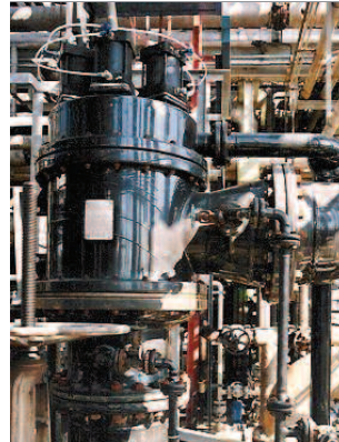
Once through sea water cooling system chemical industry

Superior Filtration Limited is also able to offer the AGF autonomous valveless gravity sand filter for situations where the cooling water system problem is fine particulate matter and the system needs to be treated, normally on a side-stream basis. Ideal for Zoned Hazardous Areas as no electrics, controls, instrumentation or backwash pumps are required. Picture shows Typical Installation of AGF Autonomous Valveless Gravity Sand Filter on Side-Stream Filtration of Cooling Circuit Oil Refinery.