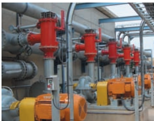
Re-circulated ground water cooling system 5 duty mining industry

Kleerflo filters are used in once through cooling systems, both ground and sea-water; and are also utilised in re-circulating ground water systems where the full flow is filtered to remove problematic particulate matter. For larger flow rates, and in order to overcome the logistical problems associated with a single duty/standby system, Kleerflo filters are often installed in banks of a number of filters each filtering a portion of the flow, with a single standby for that bank of filters, thus providing more manageable sized units and an easier to maintain system. The Kleerflo filter can also be used on closed circuit cooling water systems.