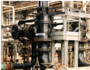
Once through sea-water cooling system duty/standby chemical industry

The Kleerflo filter utilizes cylindrical wedge wire screens mounted in the body of the unit which are backwashed sequentially at the completion of a timed out period; or by pressure differential triggered by the accumulated dirt if a pre-set limit is reached before the end of the timed out period and which overrides the pre-set timer. Dirt from the screens is backwashed to drain utilising the pressurised filtered water within the filter. Duration and frequency of screen backwashing is adjustable to suit the varying conditions encountered. The simple backwashing action of the Kleerflo requires no electric motors and has no rotating or spinning parts and uses a simple backwards and forwards shuttle movement to effect the cleaning. All that is required for operation is a single phase electrical supply and compressed air supply. Under some conditions it is also possible to utilise the line pressure for backwash actuation purposes.