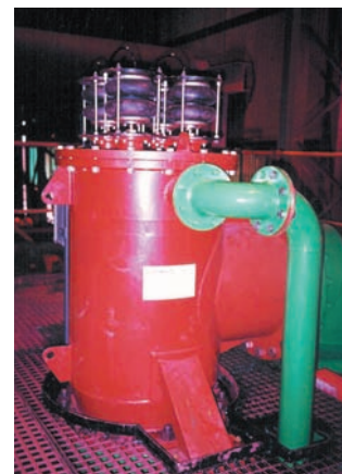
Once through ground water cooling system 8 duty steel industry