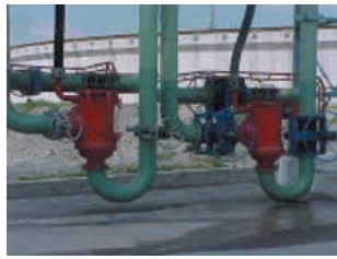
Re-circulated ground water cooling system 2 duty mining industry