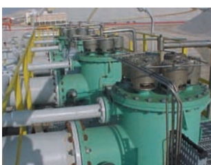
Once through sea-water cooling system 3 duty/1 standby oil refinery