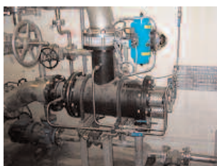
Once through ground water cooling system hydro electric power station