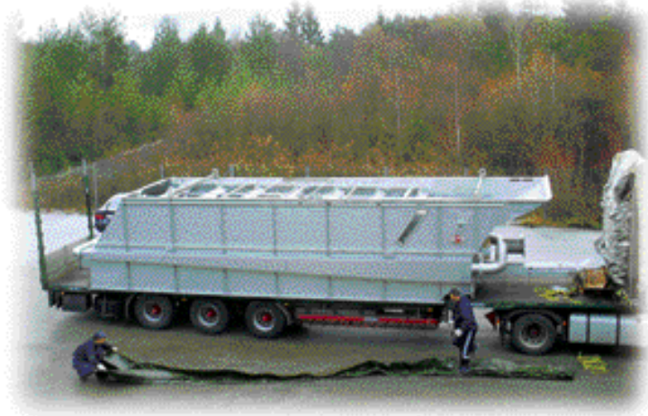
MCH 60 - Transport