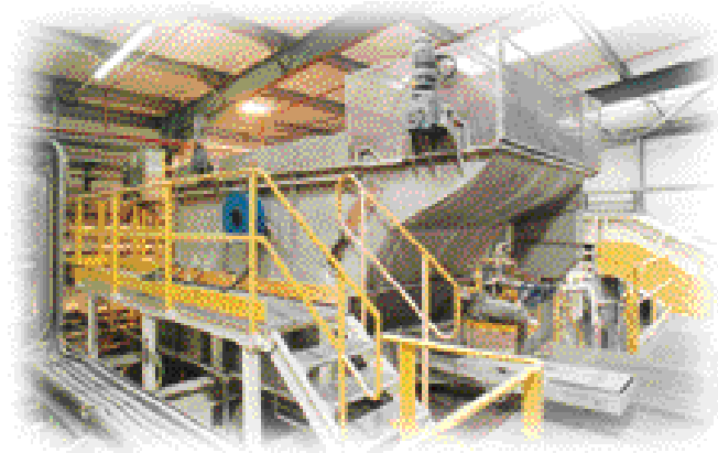
MCH 30 - Effluent treatment (paper mill)