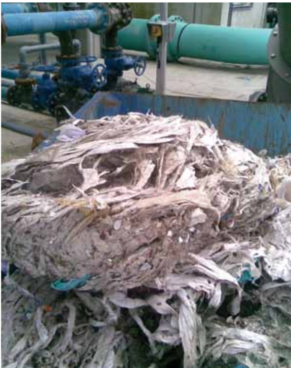
Typical, well-compacted product, ready for disposal and meeting current legislation.

Screenings can be delivered to the Washpactor-Jet machine by conventional conveyor systems or by the more efficient washed laundry method (as pictured). The Washpactor-Jet unit can also sit directly beneath the screen discharge and process screened solids immediately. Liquids drained from the Washpactor-Jet unit are either channeled into the works drainage system or back into the incoming flow of effluent.