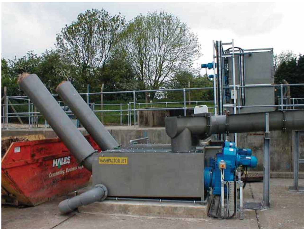
Photo shows duty and standby J+A Washpactor-Jet™ machines with a screw diameter of 300mm.