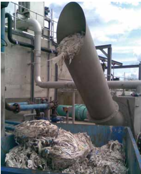
Elevated screenings outlet into a standard skip.