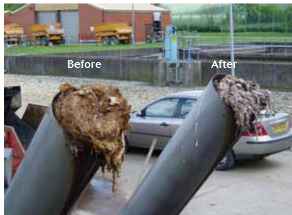
Before and after pictures of the J+A Washpactor-Jet™ machine that has been fitted with the wash water feature. This feature is an integral part of the J+A Washpactor-Jet™ design. The improvements (both visually and in terms of odour) are significant and sufficient for normal conditions.