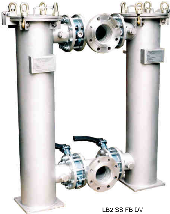
LB2 SS FB DV DOUBLE LENGTH BASKETS

Features, fittings, orientations all to customer requirements.